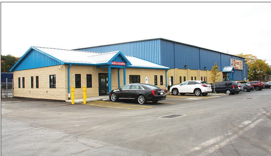
Tri-State Trailer Sales, Inc.'s new office addition.