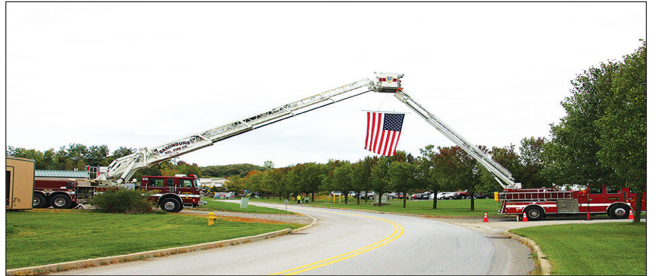
- All photos by Dan Pollock - Turn to page 6 to read Pittsburgh Power's story on the show.