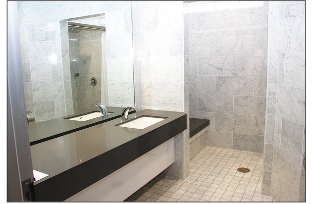
Sparkling clean showers and restrooms.

1971 and built their flagship location, "The Truck World Mall" in Hubbard, Ohio at I-80 exit 234 in 1977. A second location was opened in 2016 at I-76 and Bailey Road, near North Jackson, Ohio. Truck World also owns and operates 4 gas station/convenience stores in