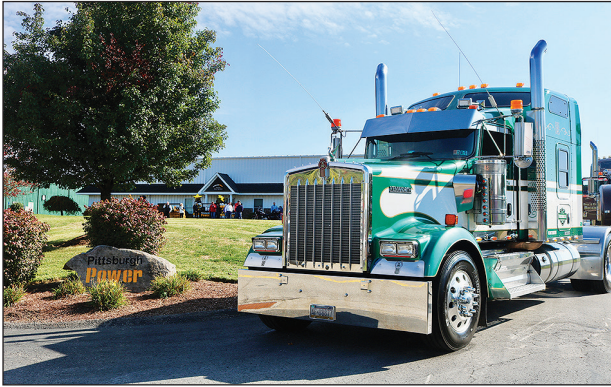
1st Annual Victory Road Truck Show was a great success!

Pittsburgh Power and Long Haul Detailing hosted the Victory Road Truck Show on Saturday, October 3 rd . This was our first truck show, and it was a huge success. 97 trucks, antique trucks, a couple Rat Rods, some pickup trucks, and one 1-ton Chevy that was powered by a 3126 Caterpillar Engine. There were vendors selling truck related items, food trucks, plenty of dogs (the 4-legged type), and many people enjoying themselves on a beautiful Western Penn-