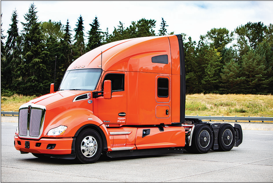
Kenworth will provide The Driver's Truck™ -- a Kenworth T680 -- as the program's award to this year's winner.