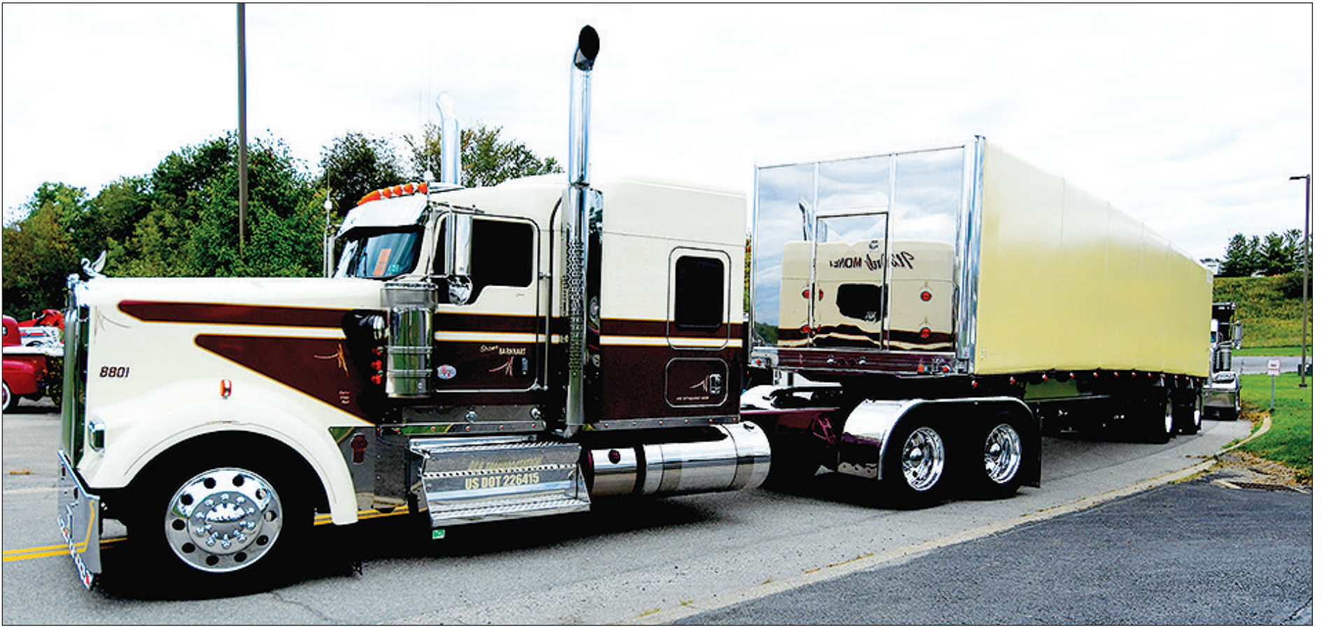
Shawn Barnhart's sleek beauty garnered a lot of attention at the Victory Road Truck Show!