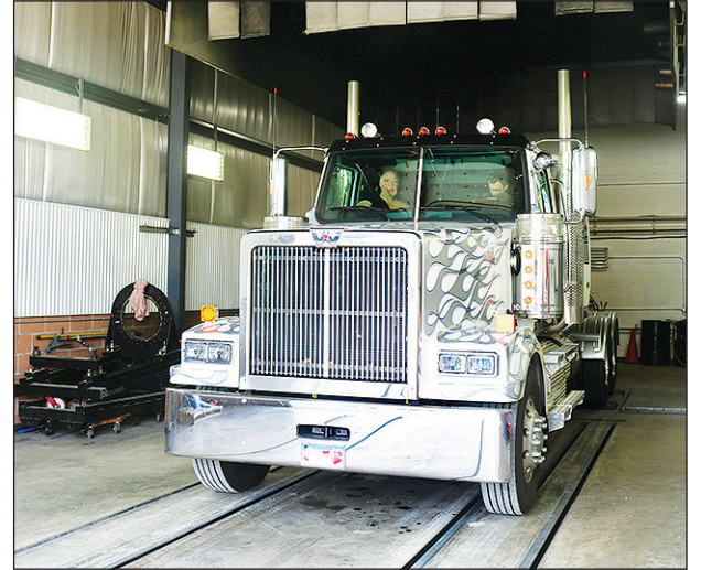
2021 Western Star on the dyno