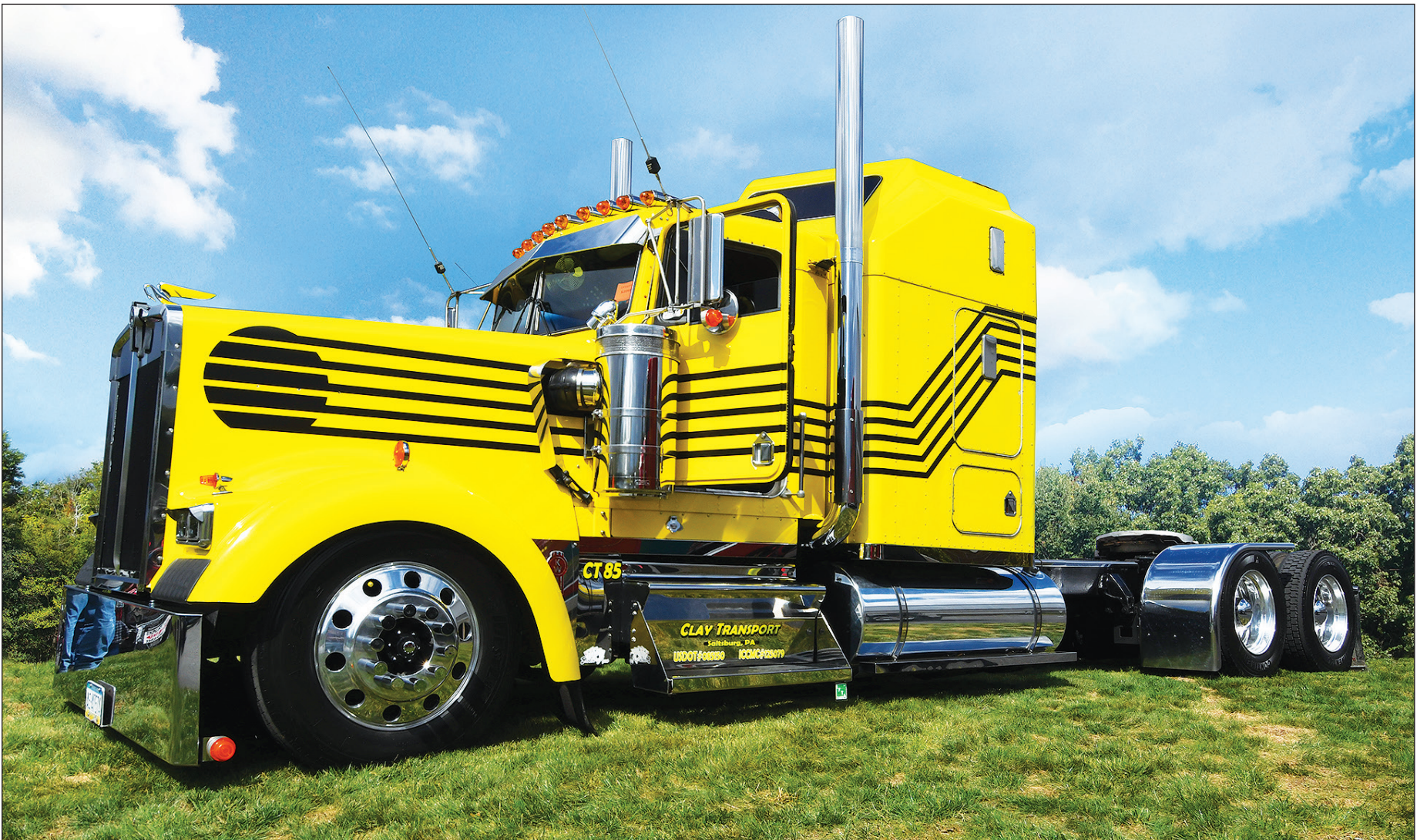
Clay Transport's stunning Peterbilt impressed attendees at the first ever Victory Road Truck Show on October 3rd. Sponsored by Long Haul Custom and Pittsburgh Power, the event was held at the Victory Road Business Park in Saxonburg, Pennsylvania. Turn to pages 8 & 9 for more photos.