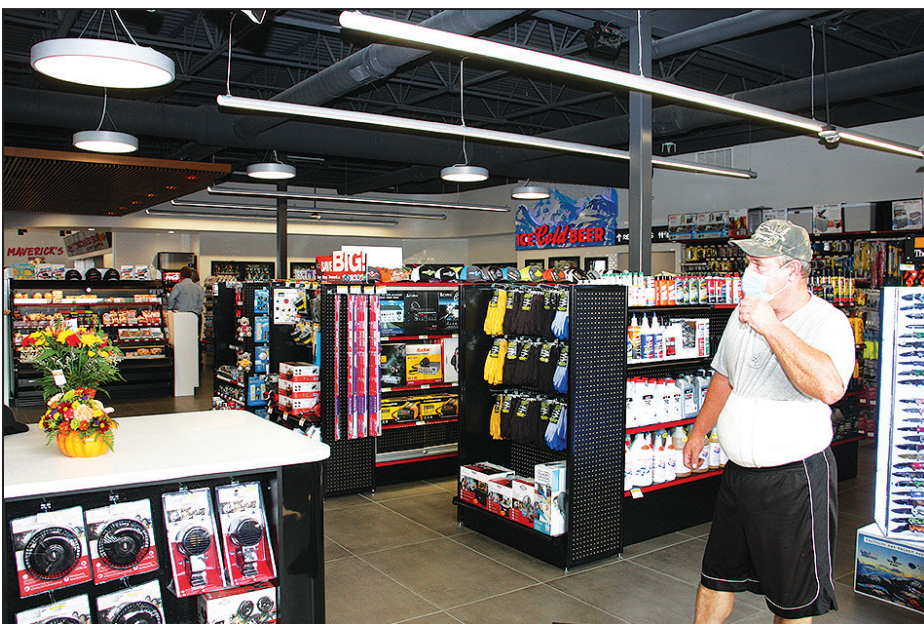
Fully stocked Truckers C-Store