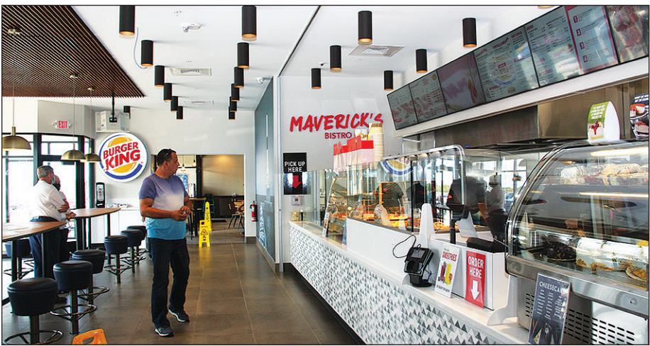
Maverick's Bistro and Burger King