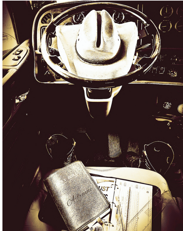
Photo Auction To Benefit Truckers Final Mile