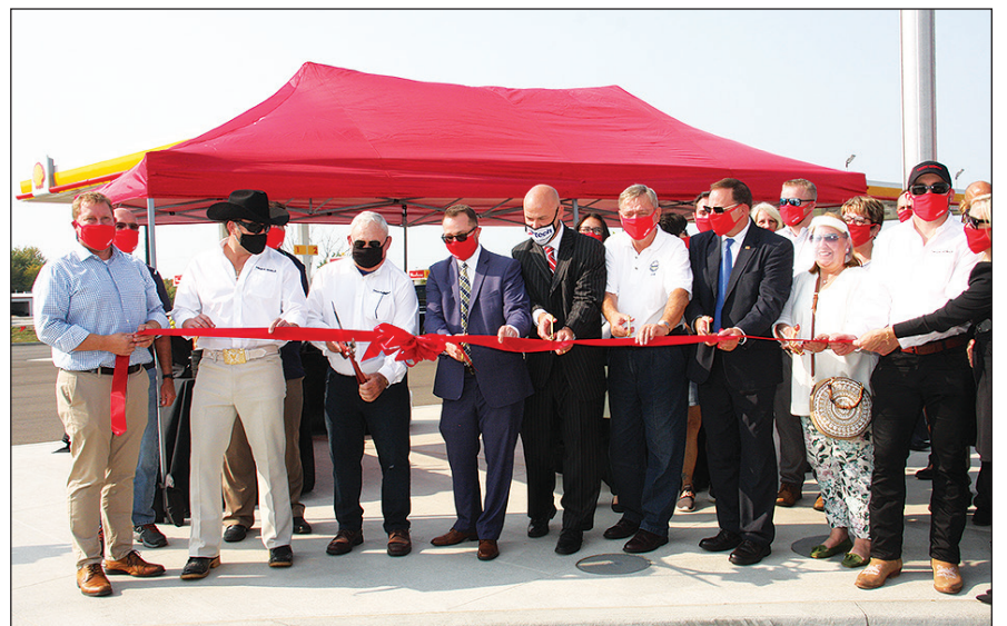
Ribbon cutting at the Grand Opening of Truck World in Conneaut, Ohio.