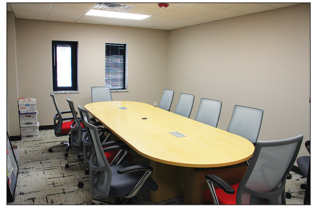
New larger conference room.