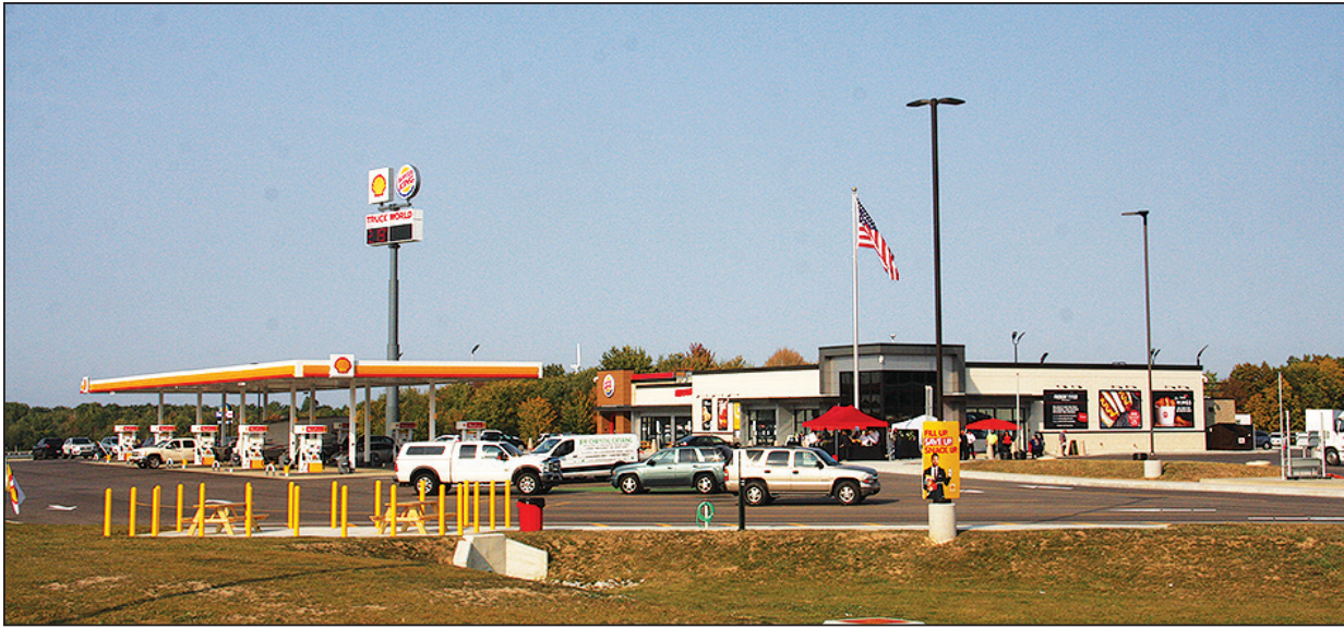
The new Truck World Travel Plaza is located at I-90 and SR 7, Exit 241 at 780 State Route 7 in Conneaut, Ohio, just a few miles west of the Ohio-Pennsylvania state line.